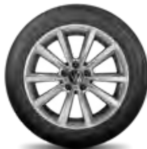
"Merano", 16-inch Adamantium Dark Metallic

Further accessories for your wheels, including valve caps, wheel bolt locking sets, tyre bag sets and snow chains, can be found in the universal accessories section on page 53.