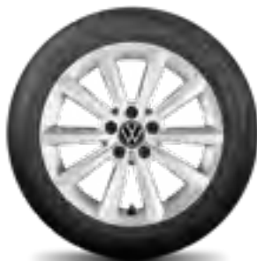
"Merano", 16-inch Brilliant Silver