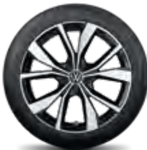
"Misano", 18-inch Black, diamond-turned