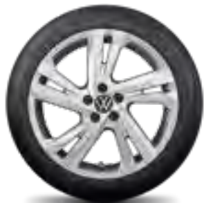
"Valencia", 17-inch Galvano Grey Metallic